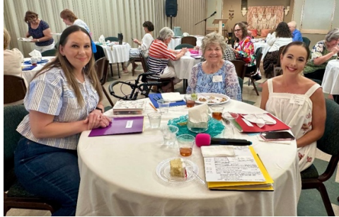
Lunch with about 45 participants