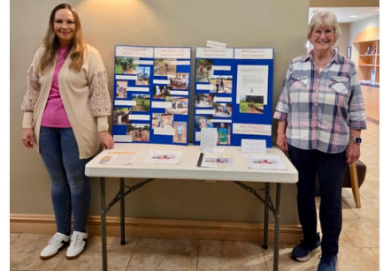
12th Living Water well completed in Africa!